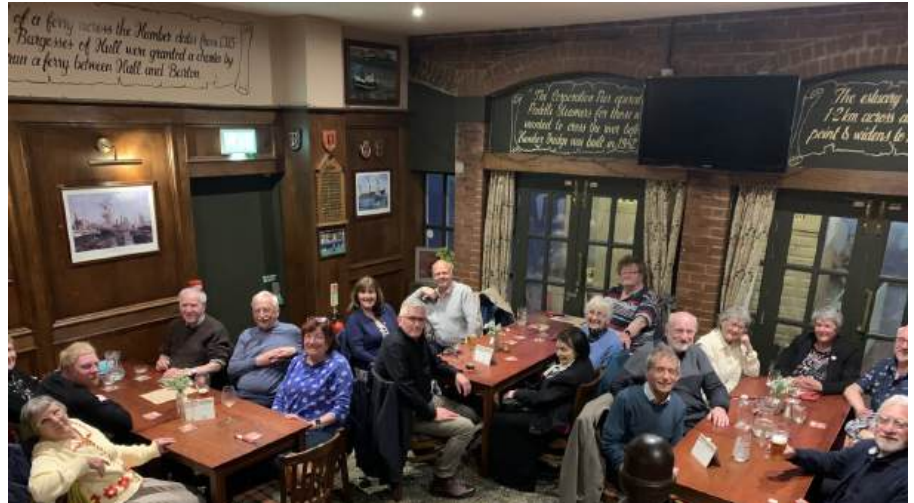
Members gather for a meal and a drink at Hull's historic Minerva pub.