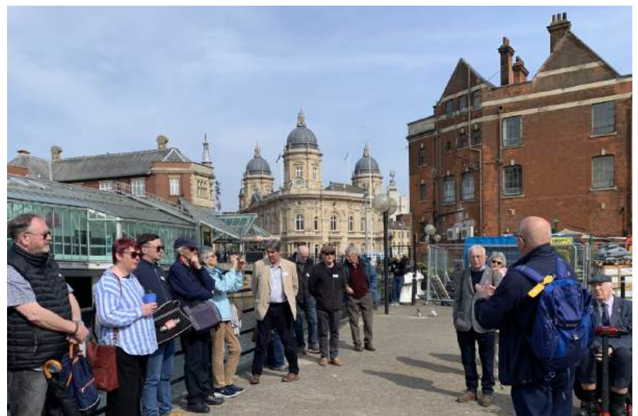
Enjoying a guided walk around the historic port city.