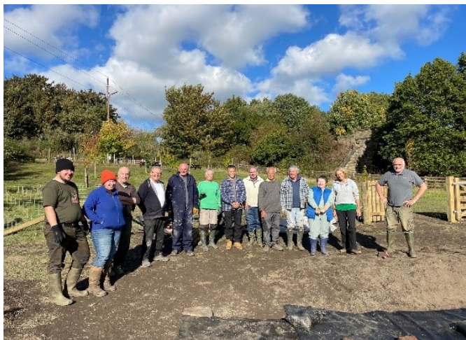
Volunteers after laying the pond's liners in Oct 2022

We opened our Jo Cox Community Wood in March 2020, a transformation of poor grazing land and a former council rubbish tip. Since then we've enlarged the site and in 2022 started an ambitious project to create a big wildlife pond. We "took the plunge" and used crowd-funding to raise the necessary £11,000. After a nail-biting few months we succeeded, and work began in September 2022.