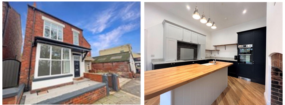
4 Mill Hill Residential Award winner