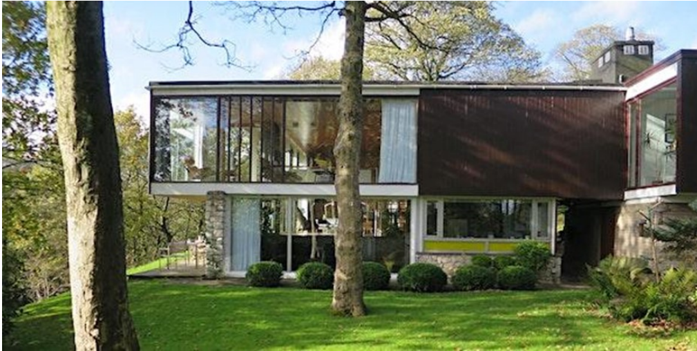
Farnley Hey (1953-4). Farnley Tyas, Nr Huddersfield.