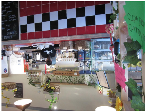
The Pavilion Café Improvement Award winner