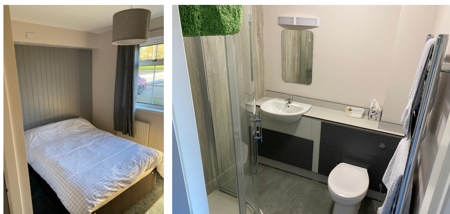
The Stables Accommodation Pontefract Racecourse

Civic/Commercial (a new or extended significant building)