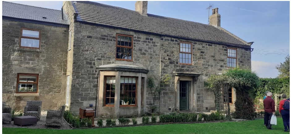
Orchard Farmhouse Special Commendation