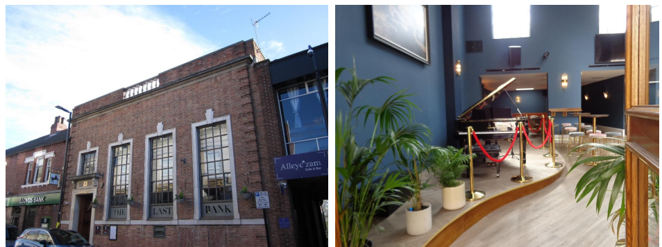
The Last Bank Regeneration Award winner