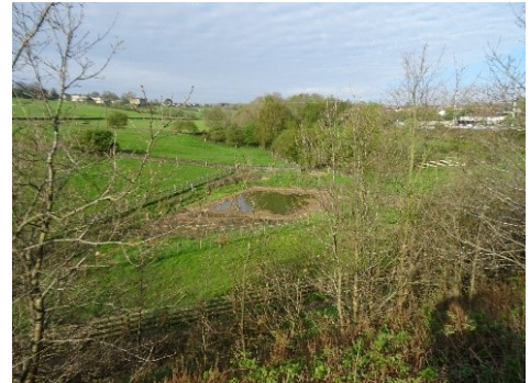
Pond at end of April 2023, viewed from Spen Valley Greenway