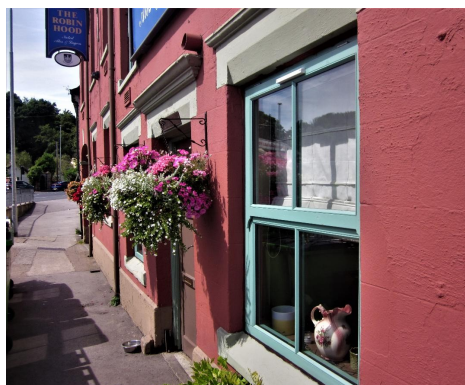
The Robin Hood Heritage Award winner