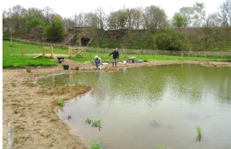
SVCS members planting aquatic and pond-edge plants

with oxygenators and aquatic plants, thanks to a grant from the National Gardens scheme. We now await some calm warmer weather so that the pond can come alive with organisms and food for tiny creatures that'll form the food chain for wildlife.