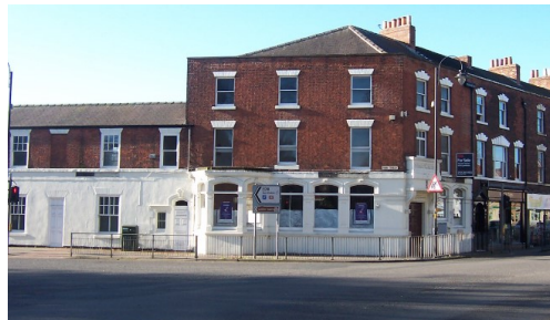
Dental Centre - Before (left) and after (right)