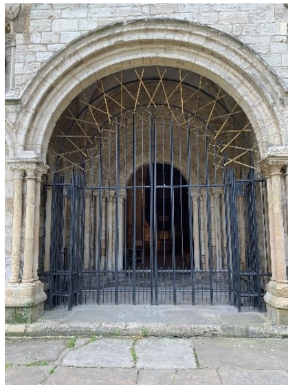
Selby Abbey, North Porch - Before (left) and after (right)

The Civic Society considered that this was a very beautiful design which elegantly echoed the stone detail of the archway behind it. It showed very good craftsmanship and use of appropriate materials and had a very practical use as well.