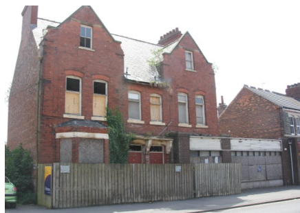
21-23 Brook Street - Before (left) and after (right)