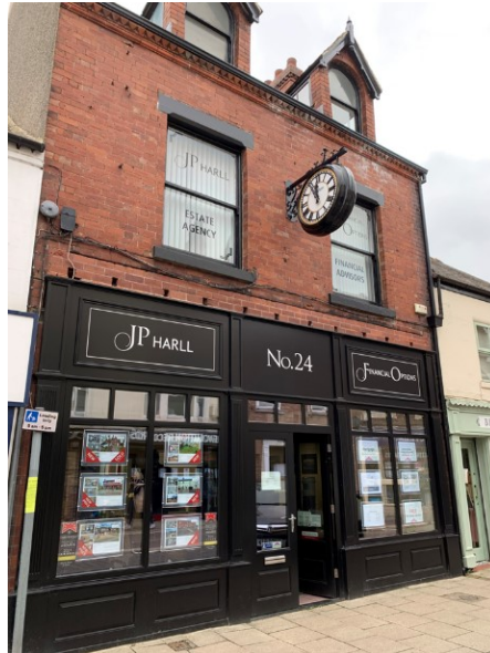
24 Finkle Street - Before (left) and after (right)

The Civic Society awarded this as it is now a well-designed and traditionally proportioned shop front which is smart and fits very well with the rest of the street. The materials and workmanship are of high quality and the added detail of the clock is very striking.