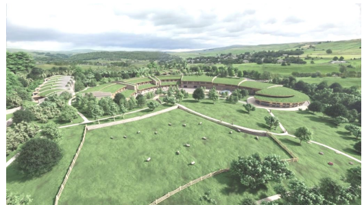
Photos Left - Now Right - Proposed

Whatever the reasons, I am hopeful that nobody else wants to take on this prospective blot on the landscape. Oh sorry, luxury leisure development on the green and pleasant, currently unspoiled fields around us.