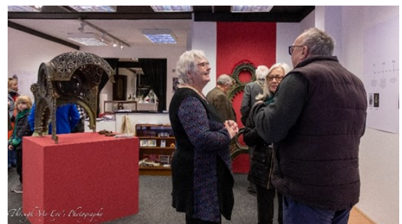
The exhibition opens