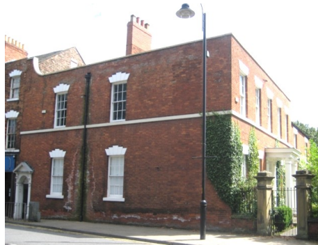
6, The Crescent - Before (left) and after (right)